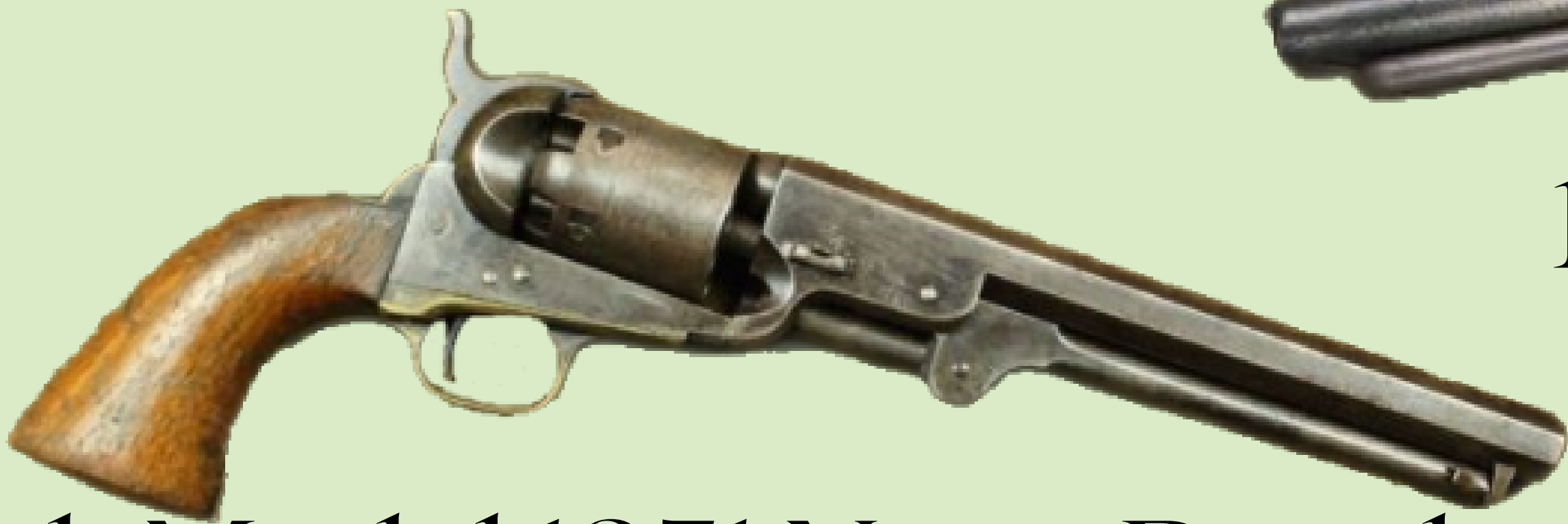
Colt Model 1851 Navy Revolver