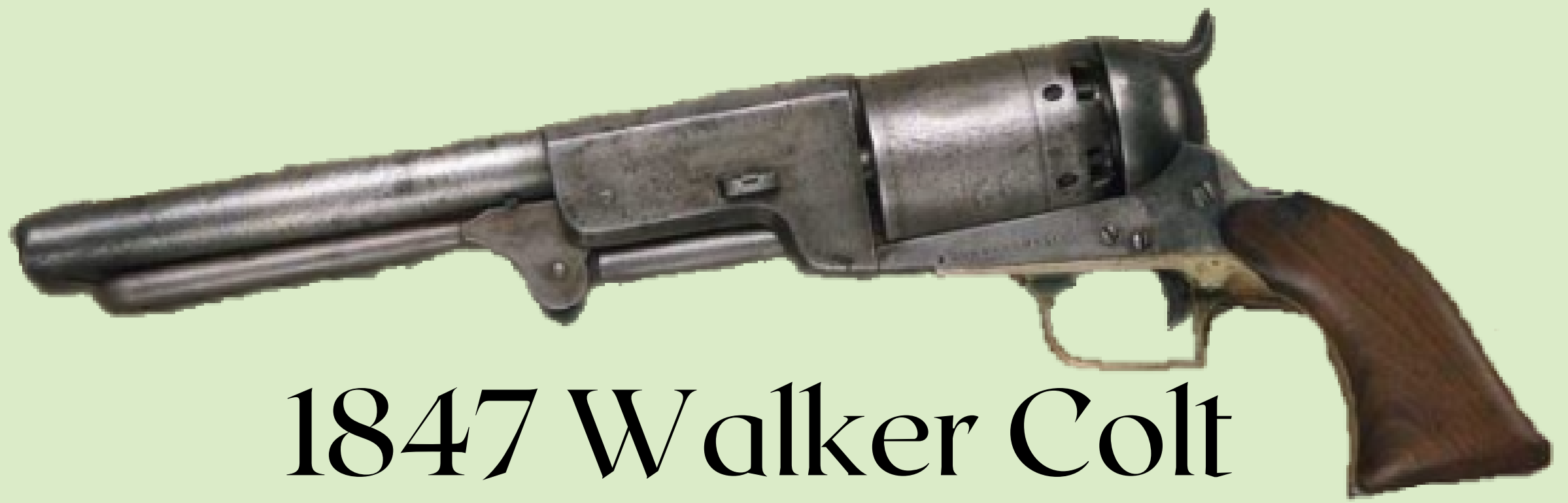
1847 Walker Colt