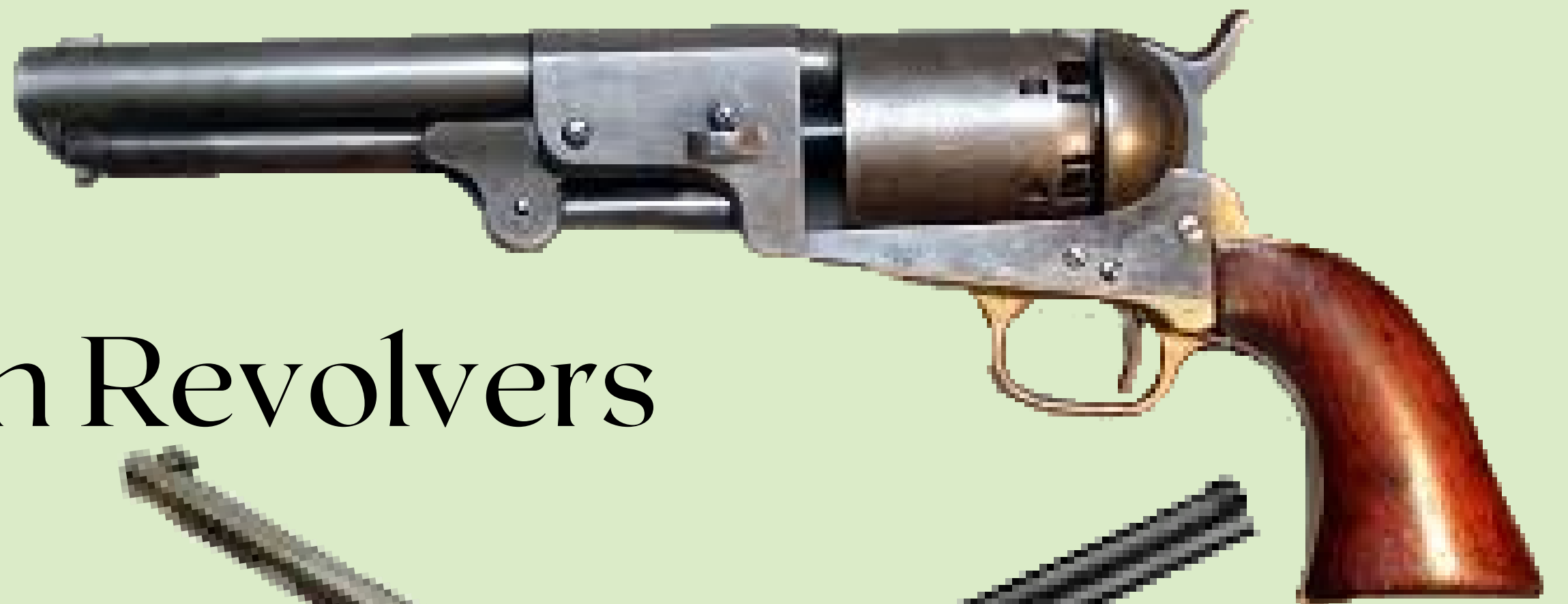
Colt Dragoon Revolvers