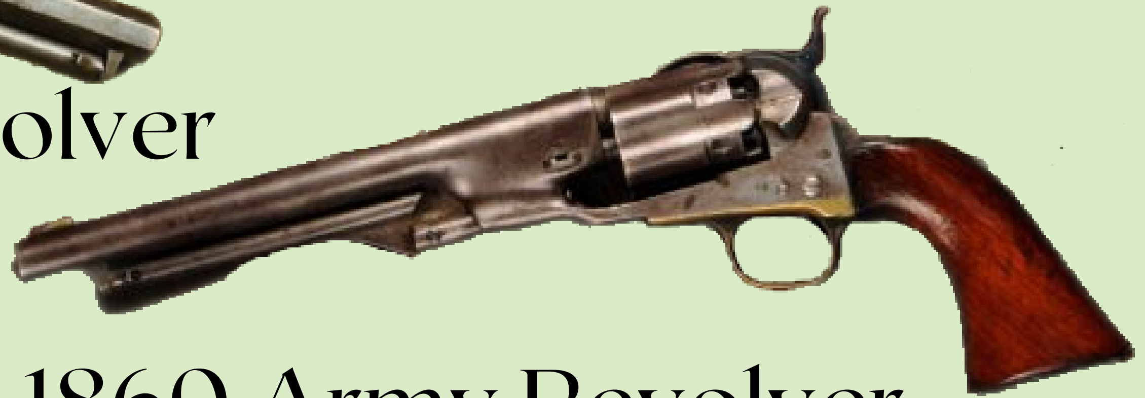
Colt Model 1860 Army Revolver