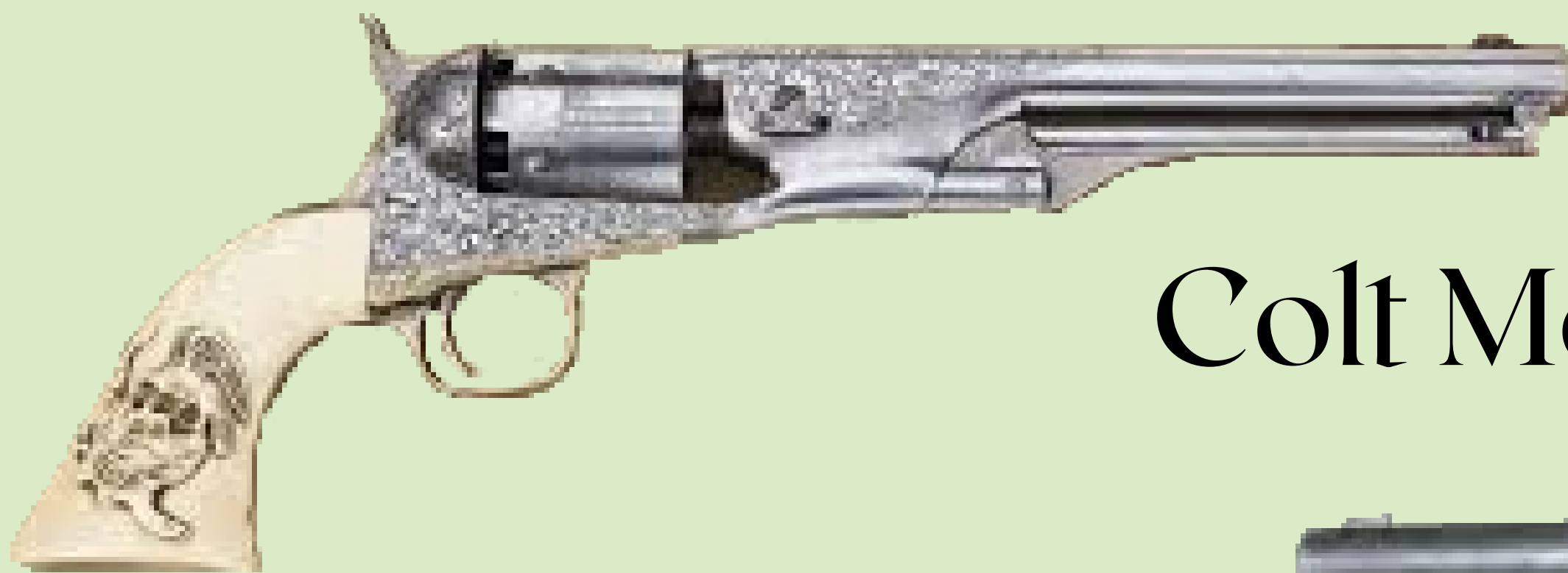
Colt Model 1861 Navy Revolver