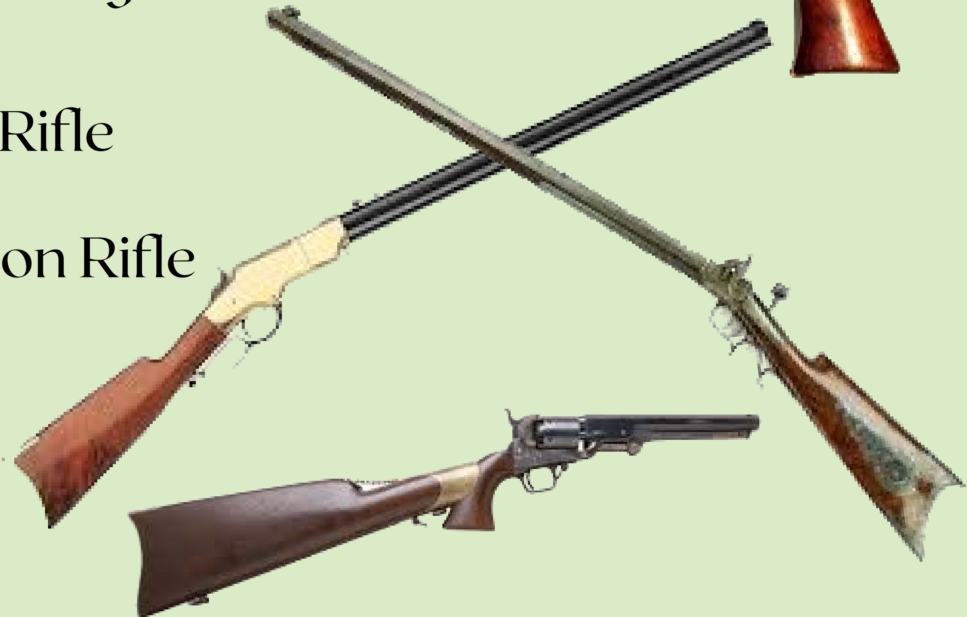
Colt Revolvers with Shoulder Stocks