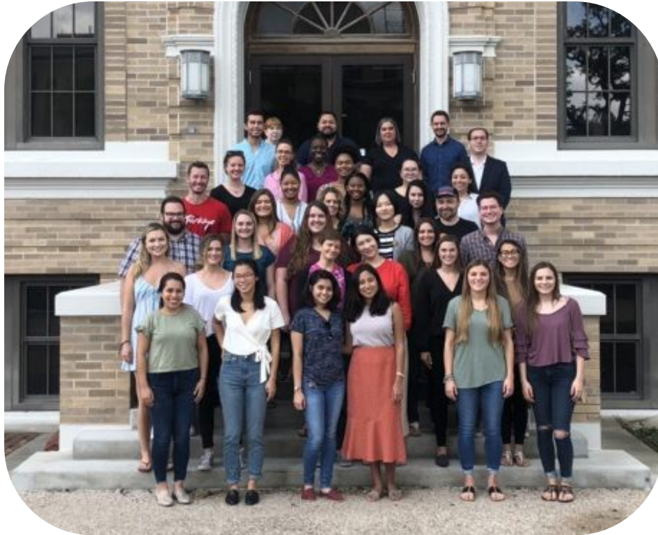
I-O Psychology Faculty and Graduate Students (Fall 2019)