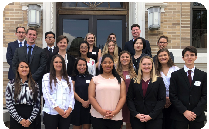
The incoming MSIOP cohort for Fall 2019